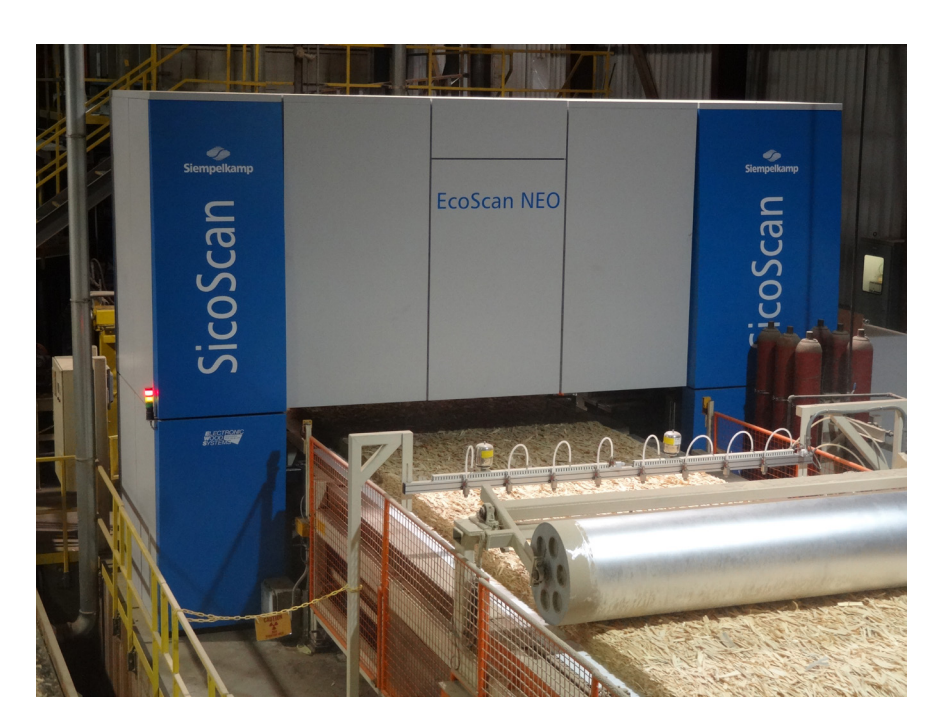
Figure 1: X-ray area weight measurement and foreign body detection installed in OSB forming